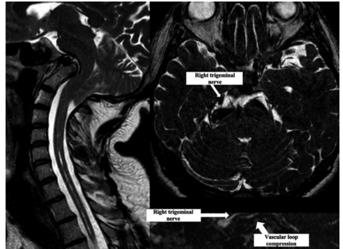
Figure 1. Basilar invagination and neurovascular conflict in a patient with trigeminal neuralgia refractory to optimized oral drugs over 12 years, who responded to botulinum toxin type A therapy.

Male patient, 34-year-old, presented to the outpatient neurology clinic with clinical symptoms consistent with trigeminal neuralgia (paroxysmal shock-like pains in the territory innervated by the right V2 and V3) persisting for approximately the last 12 years. Neuroimaging revealed basilar invagination and neurovascular conflict of the trigeminal nerve (Figure 1). During regular medical follow-up, attempts were made to optimize drug treatment, including some combinations of duloxetine (maximum dose achieved 120 mg/day), carbamazepine (1,200 mg/day), valproate (1,500 mg/day), lamotrigine (200 mg/day), and a recent trial of cannabidiol, without significant improvement. Surgical intervention was deemed inappropriate by a neurosurgeon. This debilitating condition severely impacted the patient’s quality of life, leading to suicidal ideation, severe depression, constant insomnia, and cessation of employment. Upon initial assessment at the botulinum toxin outpatient clinic, a physical examination revealed a short neck, allodynia,